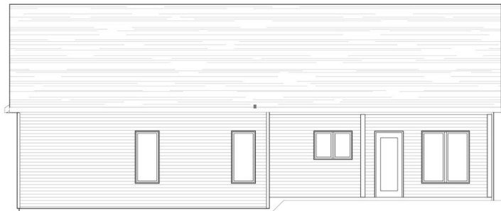
1/4'' = 1'-0''